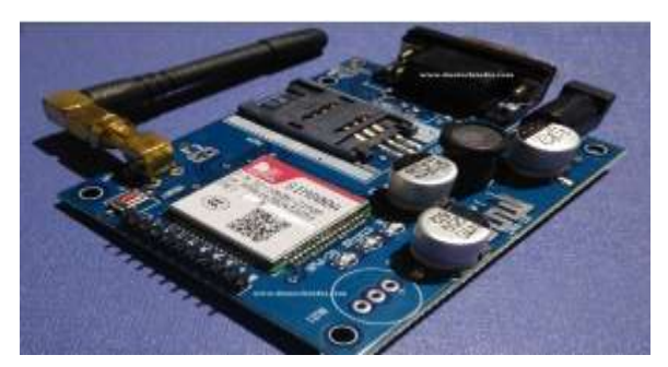
Fig 2:- GSM Module

This GSM modem has a SIM800A chip and RS232 interface while enables easy connection with the computer or laptop using the USB to Serial connector or to the microcontroller using the RS232 to TTL converter. Once you connect the SIM800 modem using the USB to RS232 connector, you need to find the correct COM port from the Device Manger of the USB to Serial Adapter Then you can openPuttyor any other terminal software and open an connection to that COM port at 9600 baud rate, which is the default baud rate of this modem. Once a serial connection is open through the computer or your microcontroller you can start sending the AT commands