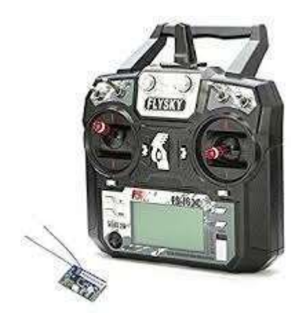
Fig3.6 The Transmitter

The transmitter is the unit censurable for the transmission of the radio signals from the controller to the drone to matter bidding of flight and directions.