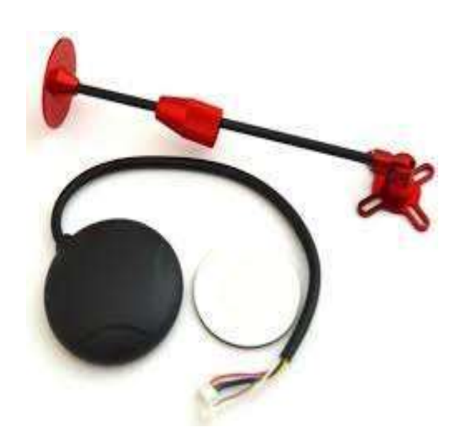
Fig 3.4 GPS Module

The GPS module is responsible for the arrangement of the drone longitude, latitude and elevation points. It is a very necessary components of the drone.