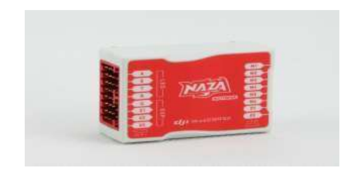
Fig 3.2 naza m-lite flight controller

It comes with the three modes Atti mode, fail-safe, GPS Mode. It has the voltage protection indicator.