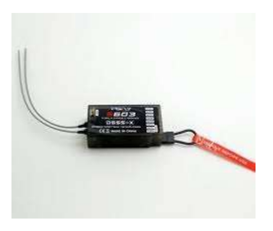
Fig3.5 The Receiver

The receiver is the unit important for the greeting of the radio signals gone to the drone through the controller.