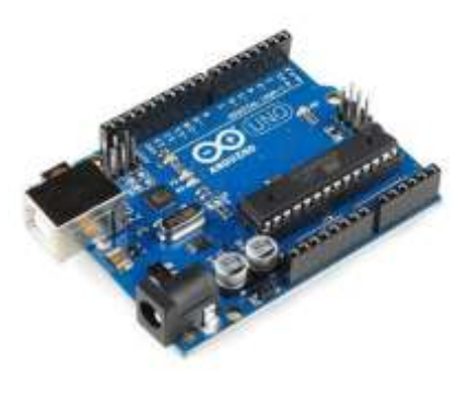
Fig -4: ARDUINO BOARD

The ARDUINO IDE permits the user to use liquid crystal display in four bit mode. this sort of communication permits the user to decrease the pin usage on ARDUINO, not like completely different the ARDUINO needn't to be programmed on a private basis for practice it in four it mode as a results of by default the ARDUINO is concerning up to talk in four bit mode. Among the circuit you will be ready to see we've used 4bit communication (D4-D7).