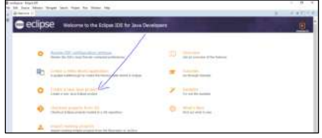
Fig7. Create a new project.

After installation complete to launch eclipse IDE for " to create new java project".