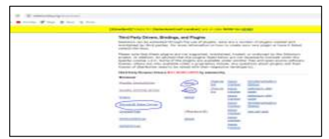
Fig4. Download Web Drivers for selenium.

International Research Journal of Engineering and Technology (IRJET)e-ISSN: 2395-0056Volume: 07 Issue: 02 | Feb 2020www.irjet.netp-ISSN: 2395-0072