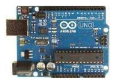
Fig -2: Arduino Uno Board

Arduino Uno Board : The Arduino is an open source PC equipment and programming and client network. It is a solitary board microcontroller. It has 14 computerized input/yield pins, 6 simple information sources, 16 MHz quartz precious stone, USB association, a power jack, an ICSP header and a reset catch. Interface the board to the framework utilizing USB. Arduino Software(IDE) is utilized to code the microcontroller.