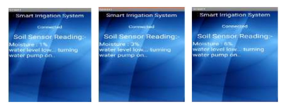
Fig -7: Screenshot of Application software