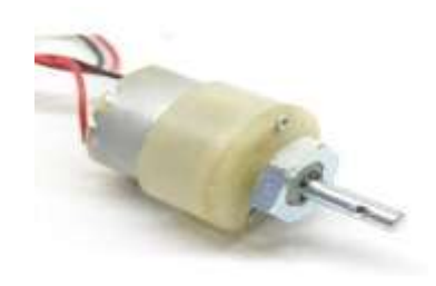
Fig.4 DC gear motor

Geared DC Motor features a gear assembly attached to the motor. The speed of motor is calculated in terms of rotations of the shaft per minute and is called as RPM.