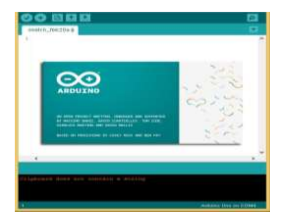
Fig.8 Arduino IDE platform image

The Arduino IDE is open source platform for arduino programming. This software is easily available with the web and it is simple and easy when as compare with the other software. It also includes Library files of different external device to interface with the arduino a boot loader has already been installed on Arduino Uno. With this boot loader we will develop software without the necessity for an external programmer to program Arduino. The programming work can easily be performed by making the required settings and methods within the IDE program [10].