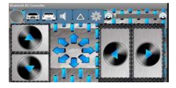
Fig.7 Bluetooth RC controller