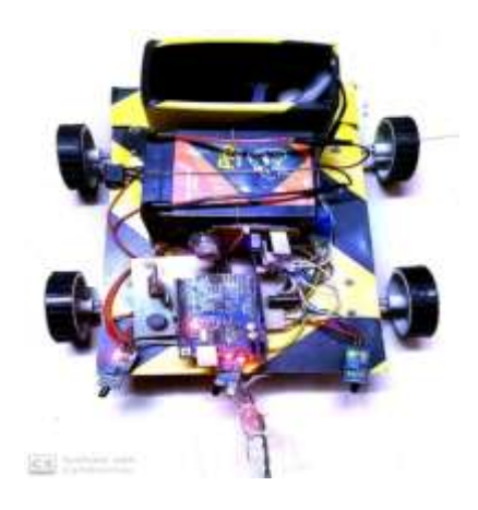
Fig.9 Hardware of fire fighting robot