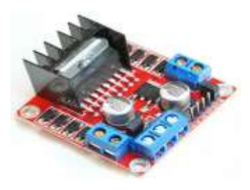
Fig.5: Motor Driver LN298

Motor drivers acts as an interface between the motors and the control circuits. Motor require high amount of current whereas the controller circuit works on low current signals. So the function of motor drivers is to take a low-current control signal and then turn it into a higher-current signal that can drive a motor.