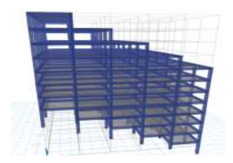
Fig -3: 5 Bay building resting on 25 degree slope