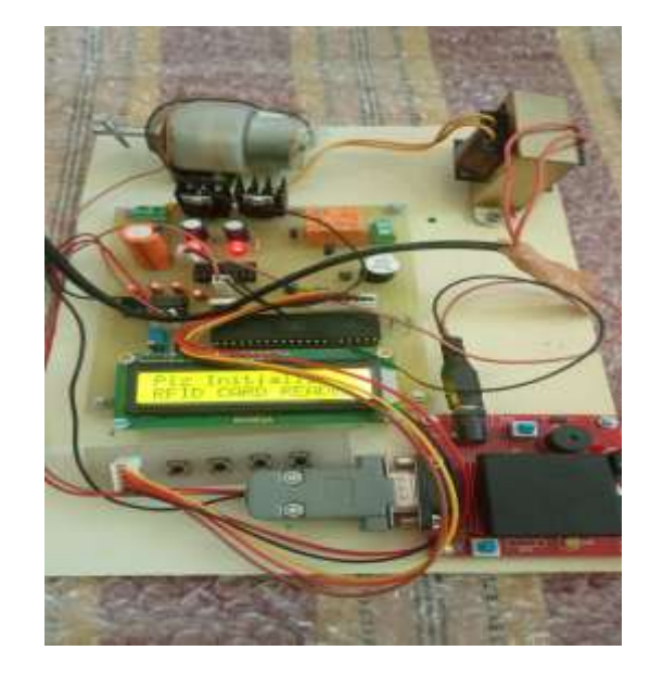
Fig-3 Complete hardware structure of the system