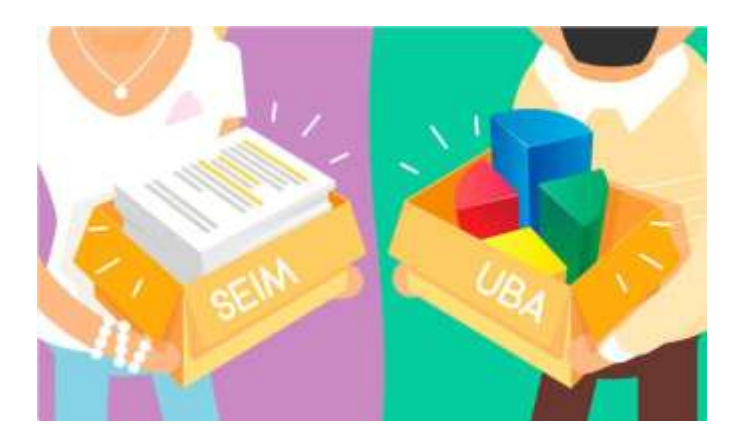
Fig. 2.2: Differentiation of UBA and SIEM

The biggest difference is that this, SIEM applications provide you with a warning to everything that happens on all of your systems. UBA applications warn you of critical events and anomalous behaviour within your network, from your users, and on your devices. SIEM is anything and everything, UBA highlights the safety issues that interest your organization. SIEM systems offer what becomes a knowledge lake, UBA systems provide data droplets or tactical data points.