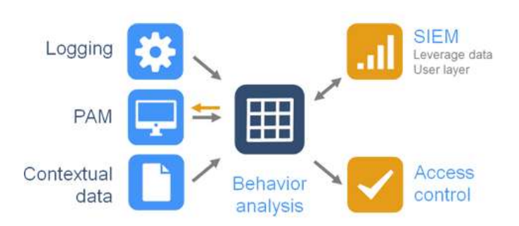
Fig. 5.1: Security architecture.

User behaviour data is right for performing business process mining because it captures everything that a user does on a computer. This information is often invaluable while preforming a process audit because it actually shows what happened, whether or not the processes are being followed, also as when and where there's a deviation within the process, then how that deviation shows effects on the output