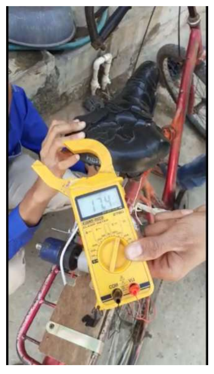
Fig.-3: Output voltage obtain during braking mode

The power output from the Motor/Generator is fluctuating not steady. The value of output is between 10-20V DC. Now if we want to store it in battery tan we have to keep it steady. For solve the problem of fluctuating DC voltage we use 12V DC Voltage Regulator.12V DC Voltage Regulator keep the voltage output steady at 12V DC.