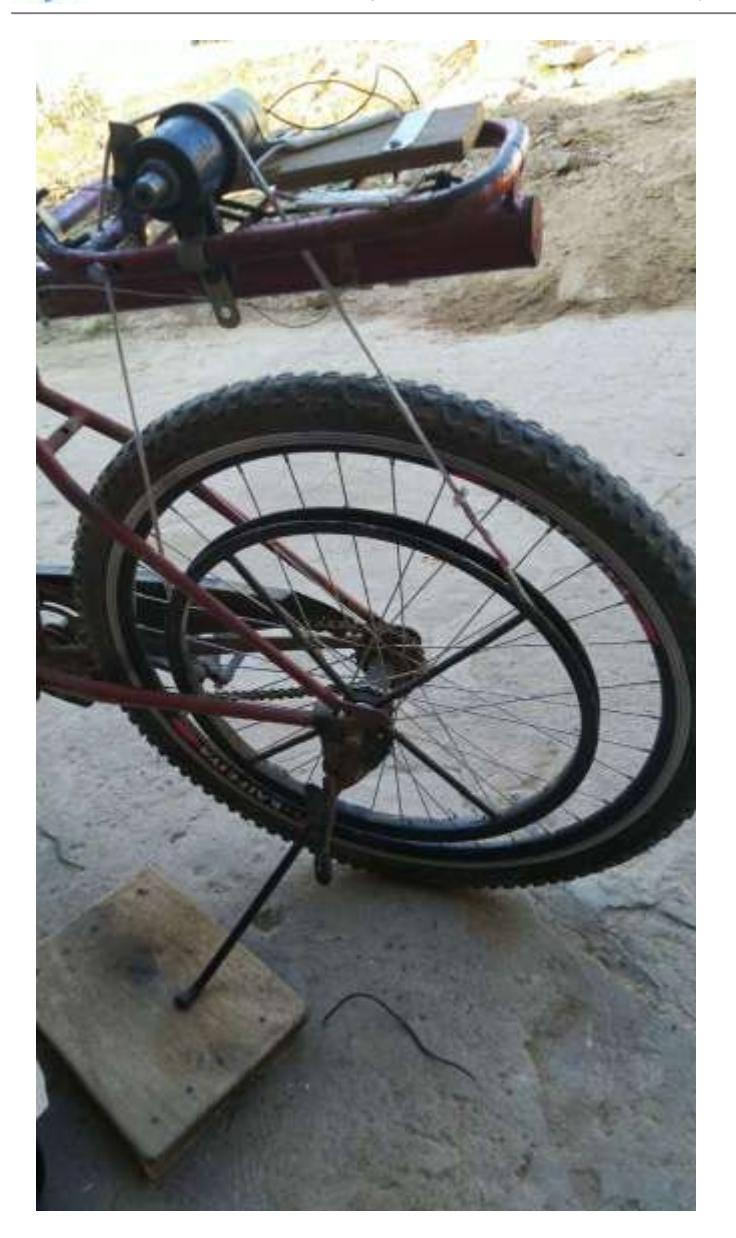
Fig.-2: Regenerative Braking System Actual Look