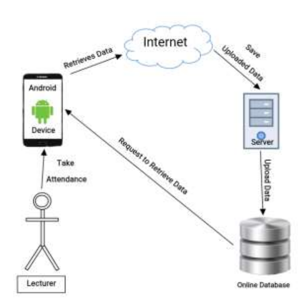
Fig 2. SYSTEM ARCHITECHTURE