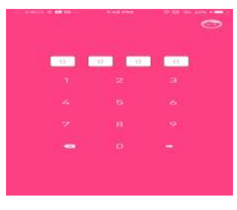
Fig 2. Student login