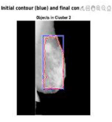
Fig -2: Initial contour and final contour

Fig 1 represents the mammographic image of original image with tumor present. It's a Malignant cell which represents final stage of breast cancer.