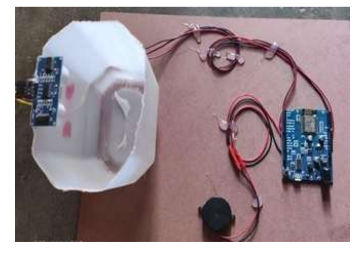
Fig 2.IOT based fuel monitoring system