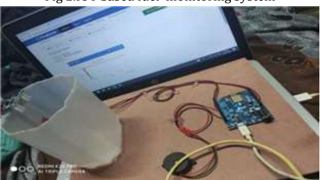
Fig 3. Output for IOT based fuel monitoring system