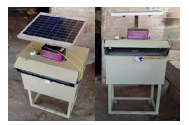
Fig 3: Working Model