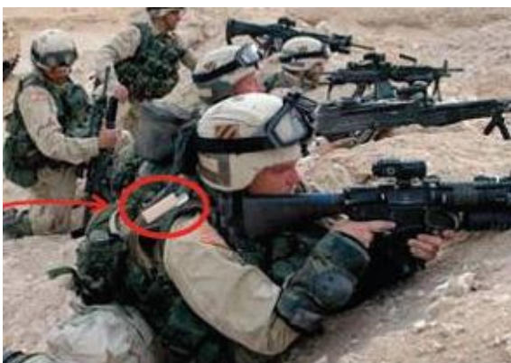
Fig.3.1 Tracker on Soldier Suit

used to log the longitude and latitude so that direction can be known easily. These devices are being added to weapons, firearms, and militaries such as the Israeli an Army which are exploring the possibility of embedding GPS devices into soldiers vests and uniforms so that field commanders can track their soldier movements in real time. GSM module can be used for effective range of high-speed transmission, short-range and soldier-to-soldier wireless communications that will be required to relay information on situational awareness, tactical instructions, and covert surveillance related data during special operations reconnaissance and other missions .So by using these equipment we are trying to implement the basic lifeguarding system for soldier in low cost and high reliability.