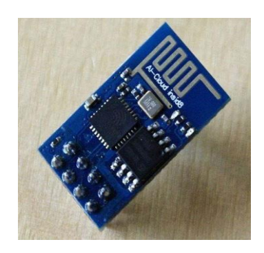
Fig 2: ESP8266 Wifi Module

ESP8266 is the name of the microcontroller developed by Espressif Systems which is a company based out of shanghai. This microcontroller has the ability to perform WIFI related activities hence it is known as a wifi module.