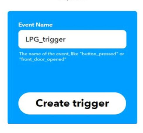
Fig 5: IFTTT Create trigger

After this, click on 'Then That' and then click on Email.