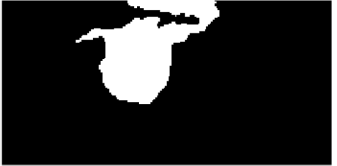
Fig no2: Black-white Image