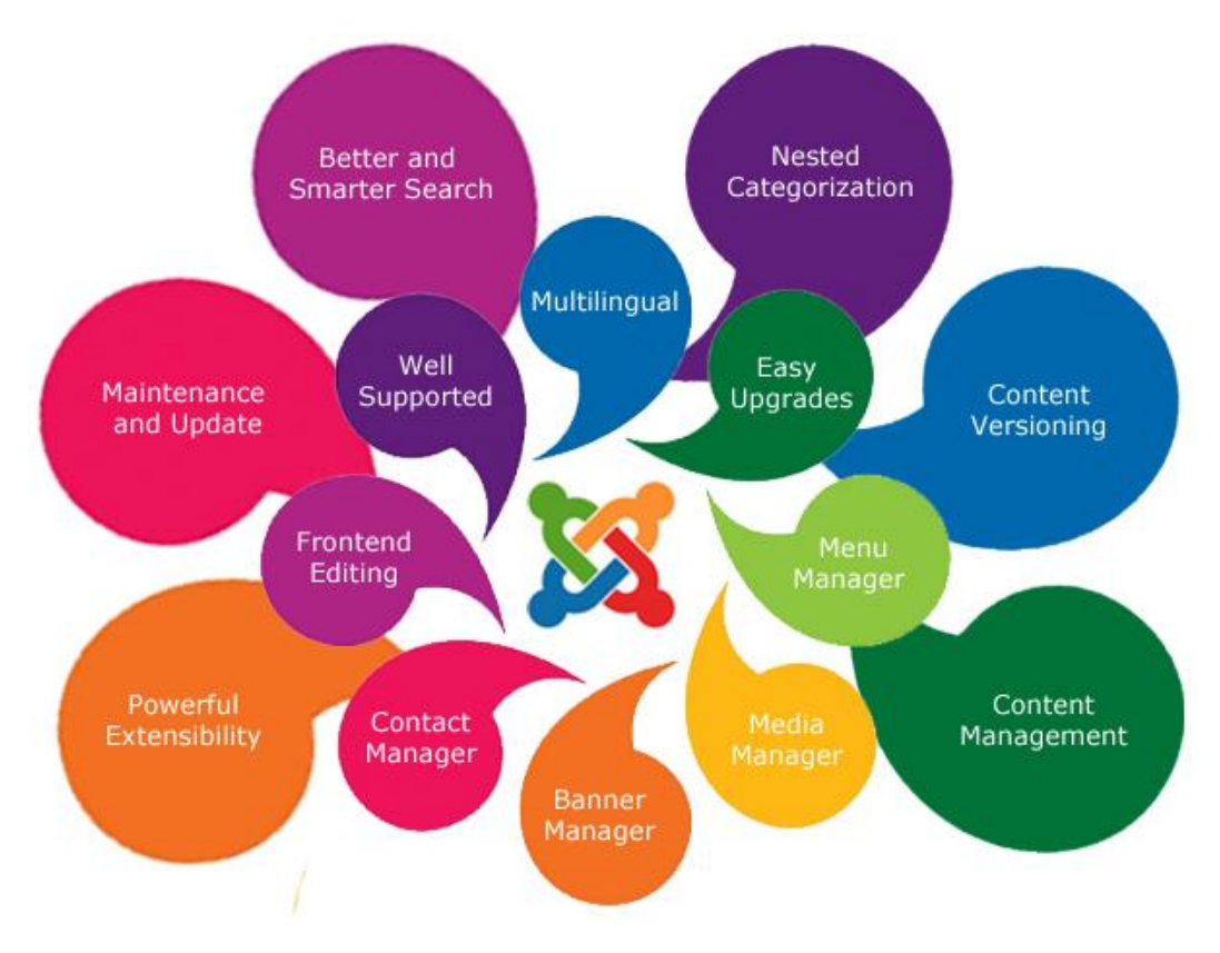
Fig -3: Main Features of Joomla