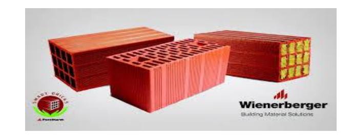
Fig 4.2 Porotherm Bricks

Porotherm Smart Bricks are 60% lighter than conventional brick thus allowing substantial savings on structural cost due to reduction in dead load. This also allows for faster construction and ease of handling.