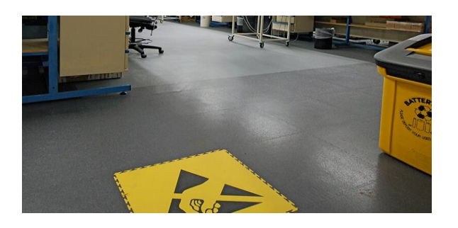
Fig 4.5 Eco tile flooring

e) Rice husk Ash