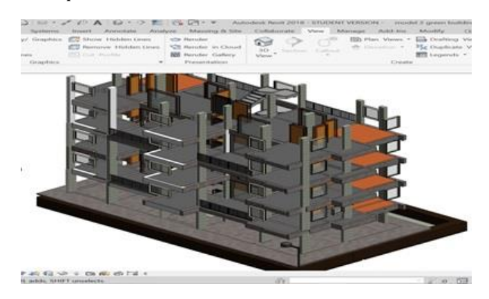
Fig 4.4 Bamboo flooring Revit Autodesk image

Bamboo flooring is becoming a popular and attractive alternative to hardwood flooring because of its cost, durability and eco-friendly properties. Bamboo is a regenerating grass so it grows much faster than hardwood trees, making it more sustainable and environmentally friendly. Flooring made from bamboo is a dimensionally stable product.