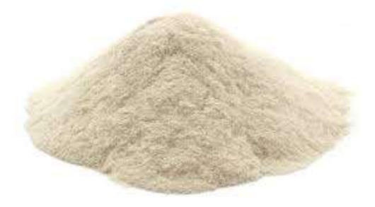
Fig-1: Xanthan gum

This anionic polysaccharide is produced by the bacteria Xanthomonas campestris. Xanthan gum's negative charge comes from its carboxylic acid (-COOH) groups, since hydrogen atoms easily dissociate from these carboxylic acid groups to form carboxylate (-COO-) anions. Xanthan gum can also form hydrogen bonds with its numerous hydroxyl (-OH) groups. Small amounts of xanthan gum significantly increase an aqueous system's viscosity, which makes it a commonly used commercial substance. However, since the xanthan gum solution is pseudoplastic, its viscosity decreases with an increased shear rate. Xanthan gum also forms a viscous hydrocolloid when mixed with water, so it can also be considered dissolved in water. Xanthan gum hydrates immediately in cold water and is extremely stable to pH (from 2.5 to 11), heat and shear. Figure shows Xanthan gum used.