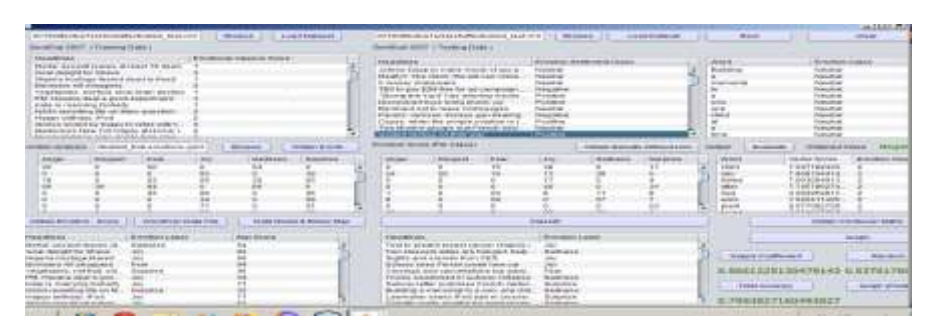
Fig No.2: Experimental Result of Proposed Architecture