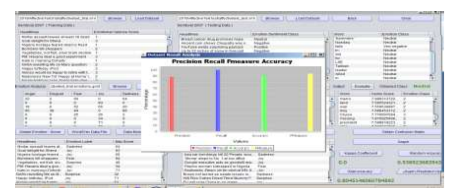
Fig No.3: Graphical Representation of Dataset Result Analysis