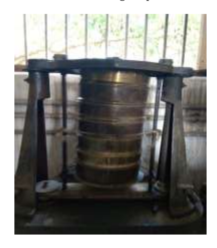
Fig 2: Mechanical sieves

2.1 Sieve analysis of bottom ash: It is a analysis of bottom ash expressed in terms of various size of can be collected at various size of bottom ash will be collected in successive sieves and the sieved sample ranging from 600 to 150 micron sized can used for testing for proximate analysis test.