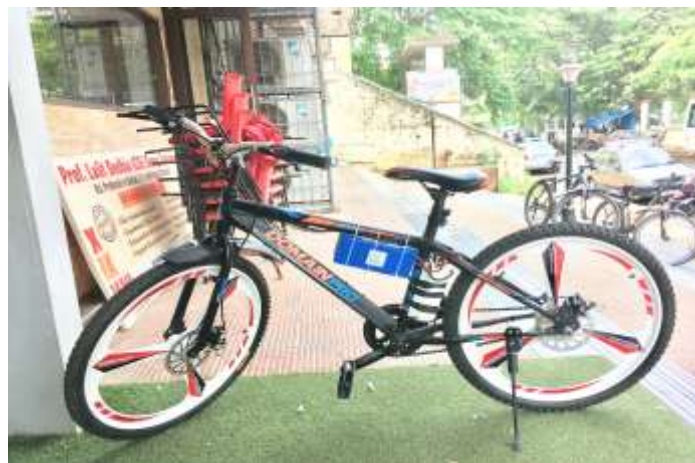
Fig. 3 - Model XCELERATE 2.0

Lastly, we have out XCELERATE 2.0 model, which is an advanced version of our first model. This e-bicycle has a much more sportier look and also targets teenagers. Its distinctive white alloy wheels enhance the appearance of the e-bicycle.