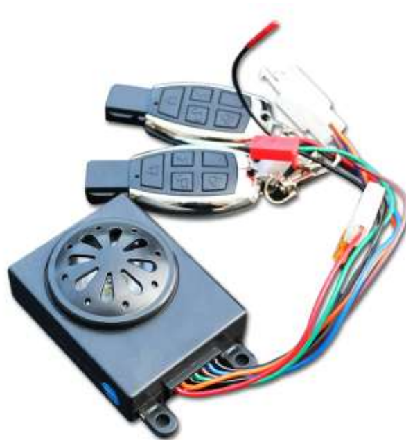
Fig 10 - Anti-Theft System

second key to unlock the motor and motor controller behind the seat, the e-bicycles immediately jerks and starting ringing and alarm system. Using IoT, a message is being sent to the owner's phone, so that they are rapidly informed and they can take action accordingly. Technically, the motor controller has a control circuit with a microcontroller, which locks the motor by generating reverse torque until the external torque is eliminated. Figure 10 is an image of a two-key system mechanism, essentially the anti-lock system.