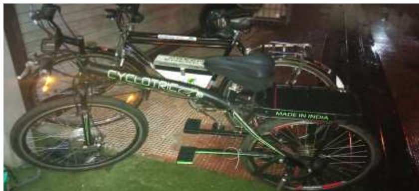
Fig. 2 - CYCLOTRIC 1.0

Our second and extremely unique e-bicycle is the CYCLOTRIC 1.0 model. This sporty-looking e-bicycle targets teenagers and college-going students. Above all other features, this e-bicycle works on an entirely chain-less mechanism, rather it works on gears, providing the rider with a unique up and down motion, rather than the regular 360 degree motion.