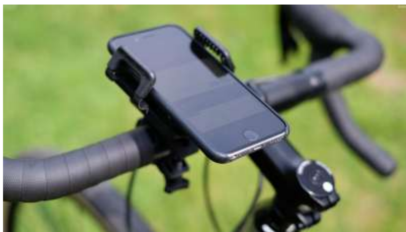
Fig. 9 - Phone Holder

A great addition to any e-bicycle is a holder for our phones. Essentially, we require our phone to reach any destination. Therefore, we have used this extremely useful phone holder. Figure nine is an image of a phone holder similar to the one we have attached to our e-bicycle.