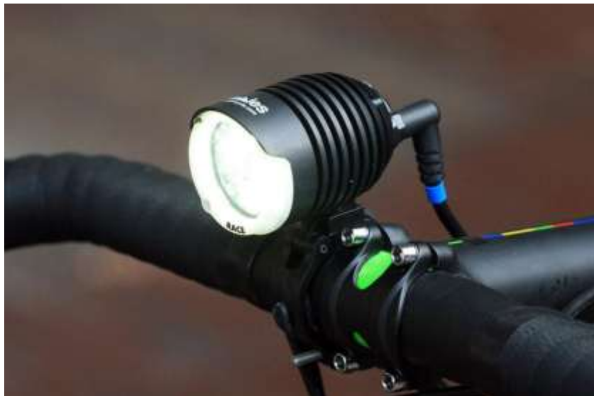
Fig. 8 - Headlights

Right below the handles and right above the front wheel, we have attached a headlight which just makes the e-bicycle that much more road friendly. With the help of this headlight, the user can safely ride this e-bicycle even at night time or when it's dark/raining/foggy. In other words, this e-bicycle is extremely road-friendly and environmentally friendly as well. The energy source of the headlight is also the battery. Figure eight displays an image of a headlight similar to the one we have used on our e-bicycle.