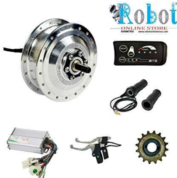
Fig. 7 - BLDC Hub motor, BMS, Throttles, Brakes, and Speedometer

This e-bicycle is driven by a 36V 250W BLDC Hub Motor. BLDC stands for Brushless Direct Current and it is a synchronised motor in which the magnetic field generated by the motor and the stator have the same frequency. We have used a BLDC motor rather than the conventional motor since it has many advantages. Initially, the cost of a BLDC motor is considered relatively high, however its longer life span, low maintenance, and high efficiency rates definitely make it worth the cost. This motor doesn't require any brushes, which instantly leads to a longer life span. Additionally, this also helps the motor have a higher starting torque, a higher no load speed and little to no energy loss. The motor has an efficiency rate of 83.5%, the weight is 3.10 kgs, and has a no load RPM of 447. Figure 7 is an image consisting of the BLDC Hub motor, the BMS, the throttles, the brakes, as well as the speedometer.