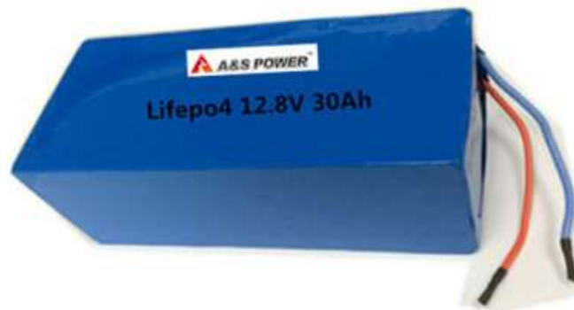
Fig. 5 - Lithium Ferrous Phosphate Battery

Battery, which is in fact a rechargeable battery made with lithium iron phosphate as the cathode material. The primary advantage includes faster charging time than other batteries. This battery also has extremely high chemical and thermal stability - meaning that the batteries do not explode at high temperatures. Even though these batteries add to the cost component, they dependability of them is extremely high. In addition to that, these batteries are incombustible, so in the event of any mishandling during charge or discharge, they are more stable under conditions such as overcharging or short circuit. In fact, they can also withstand high temperatures without decomposing. Lastly, a lithium iron phosphate based batteries are considered as safe and non-toxic material, so it does not impact the environment in a negative manner whatsoever. Rather, they have longer cycle life, and nonetheless, are economical in the long run. Figure five is an image of a battery similar to one that we have used.