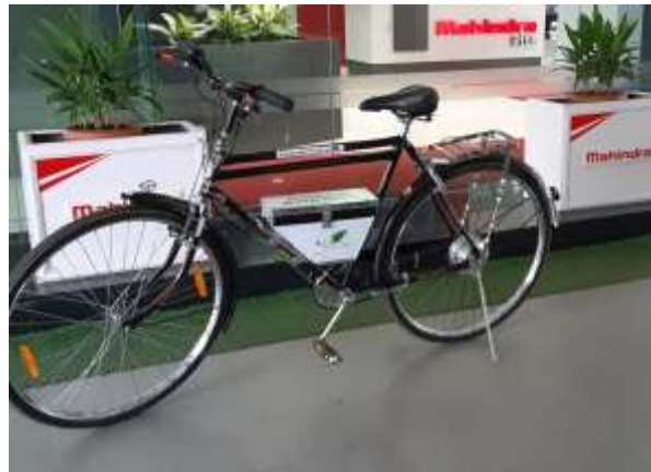
Fig. 1 - XCELERATE 1.0

Our second and extremely unique e-bicycle is the CYCLOTRIC 1.0 model. This sporty-looking e-bicycle targets teenagers and college-going students. Above all other features, this e-bicycle works on an entirely chain-less mechanism, rather it works on gears, providing the rider with a unique up and down motion, rather than the regular 360 degree motion.