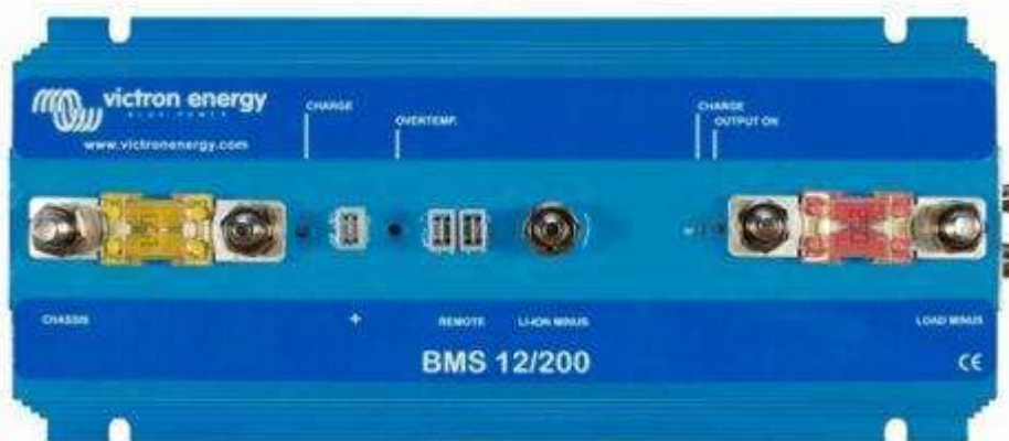
Fig. 6 - Battery Management System (BMS)

The Lithium Ferrous Phosphate Battery is additionally fitted with an pre-installed BMS, which stands for Battery Management System. The BMS protects the battery and prevents it from operating in an unsafe situation. The BMS monitors the state of the battery, calculates secondary data such as the energy delivered to the battery since the last charge, the charge delivered, the total amount of energy delivered since the battery's first use, and much more. It additionally monitors data such as the voltage, the temperature, the battery level, the state of power, the coolant flow, and much more as well. After monitoring the conditions, the BMS controlled and balances the environment by using fan exhausts. Essentially, the BMS protects the battery from over voltage, over current, under voltage, over pressure, and ensure that the battery is being charged safely by eliminating excessive in-rush currents. Figure six is an image of the BMS that we have used in the battery.