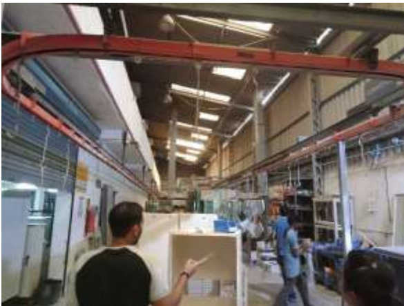
Fig -2: Conveyor belt