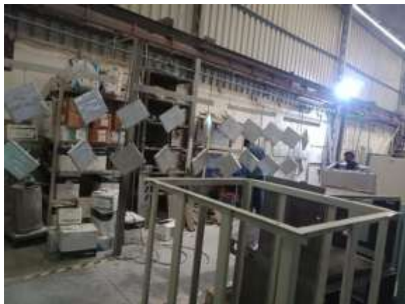
Fig -3: powder applied hooked on belt for cooling