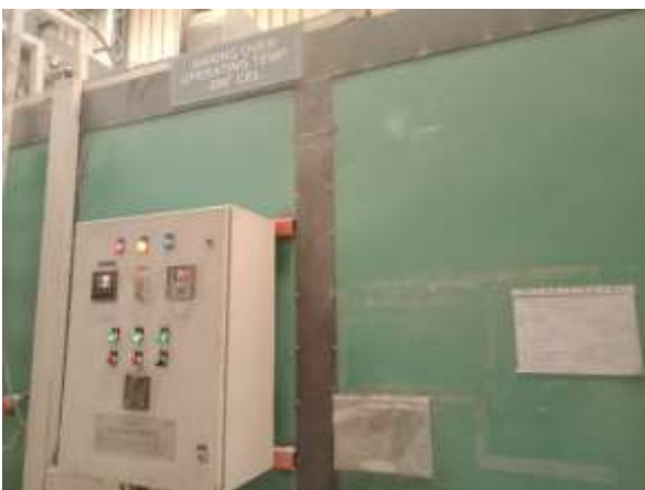
Fig -4: Oven for curing