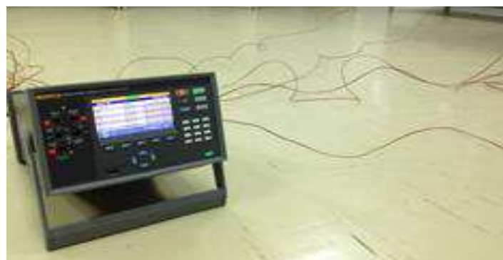
Figure 3 Measuring the temperature inside and outside the room using a multi-purpose data recorder.