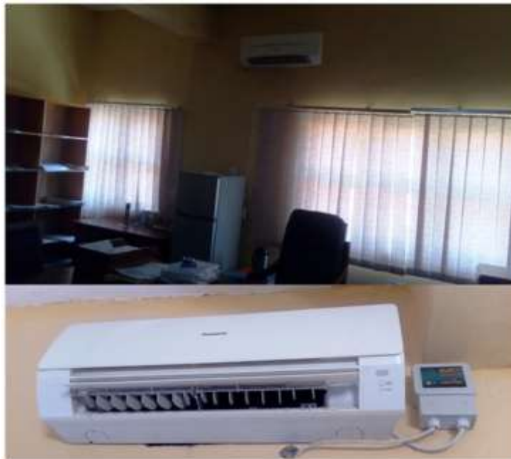
Figure -1: Rooms with air conditioners used to experiment.