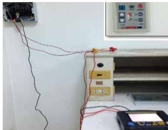
Figure 2 Measuring AC voltage power plants and power plants using the power meter.