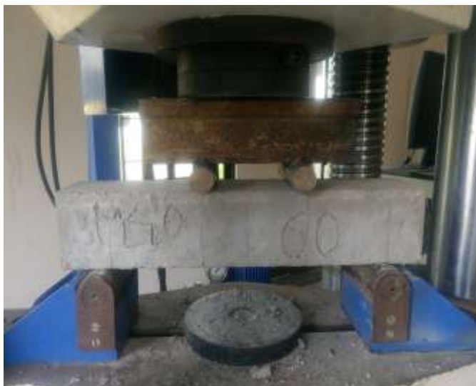
Figure 3 Flexural strength test