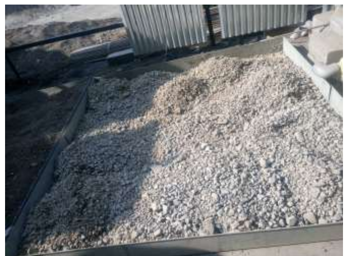
Figure 1 Recycled concrete aggregates