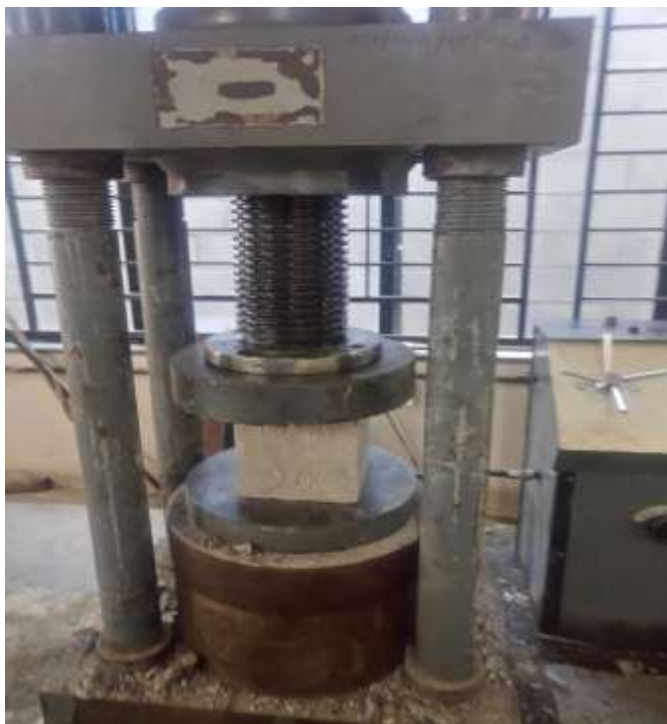
Figure 2 Compressive strength test