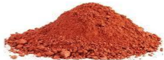
Fig. 1 Red Soil

2.1 Soil: A locally available red soil which is suitable for the manufacturing of mud blocks is been selected and used. Physical characteristics of soil are shown in table 1. Tests has be conducted as per IS 2920, IS 2720 and confined as per IS 1725.1982.