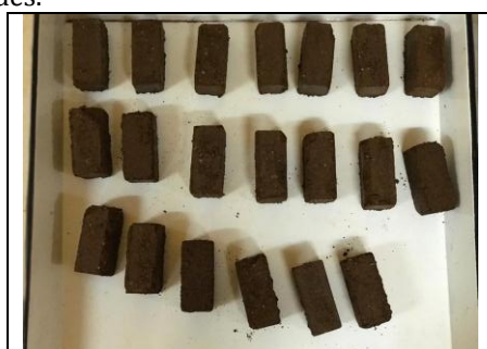
Fig. 4 Casted stabilized blocks

Stabilized mud blocks have been casted as per IS codes specification with a stabilization of GGBS and Alccofines. Two sets of cubes had casted by using 10% stabilization of GGBS and Alccofines. These cubes are cured for 28 days (regular moisture curing is adopted) and tested the cubes as per IS codes.