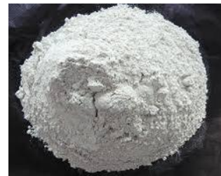
Fig. 3 GGBS

2.3 GGBS: It is been using because of its overall economy in making and as worthy as their enriched performance is aggressive environments. It's obtained by quenching melted iron slag from a blast furnace in water to provide a granular glassy product. After that it is dried and grinded into the powder. Table 4 indicates the physical characteristics of GGBS.