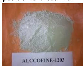
Fig. 2 Alccofine

2.2 Alccofine: Alccofine is slag with high reactivity and high lass content product specifically processed attained by the process of controlled granulation. The raw materials chiefly constitute small quantity of calcium silicates. The controlled particle size distribution is attained by processing with other select ingredients. Alccofine 1203 provides good workability and utilization as high range water reduces to increase compressive strength. Due the accurate procedure of this distribution of particle size, the alccofine gives the greater results and reduces the content of water. Table 3 indicates the chemical composition of alccofine.