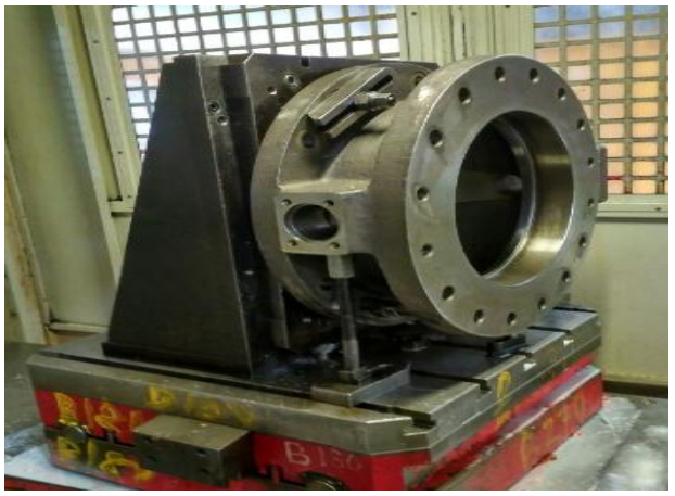
Fig-1 Single Body Fixture

In the shown Fig 1, single body TOV mounted on the fixture. At a setup change time truing of fixture has to be done by dial stand for which angle fixture will be required. In this setup only one size is covered and to load a body two dowels are required. In this system clamps are not rigid and to maintain center distance dials and stand are incorporated in the setup. This system is less efficient because of setup change time and low speed.