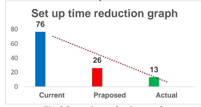
Fig- 3 Setup time reduction graph