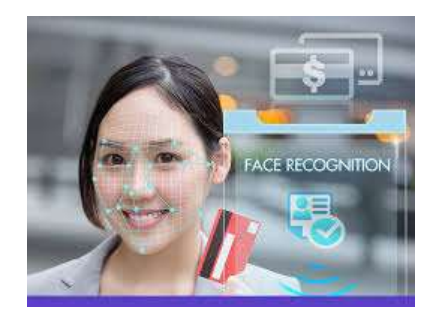
Fig 4). Face Scan Sample