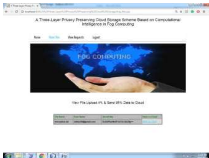
Fig 5: Screen appearing for user registration Upload 4% Data