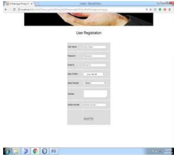
Fig 3: Screen appearing for user registration