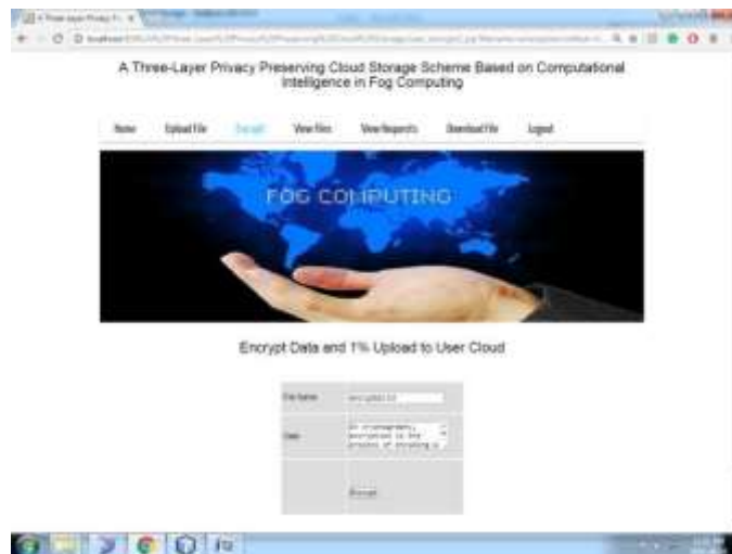
Fig 4 Encrypt of file data