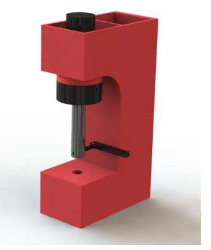
Fig. Hydraulic press operate with smart phone

feature of this project is it also operated by smart phone connected by Bluetooth with help of Arduino and blynk app.