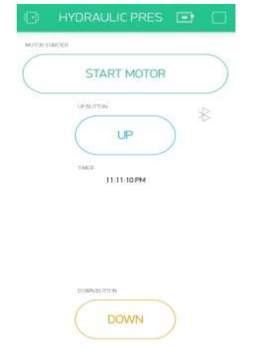
Fig. Display of Smart Phone While Operating Hydraulic Press

It controls overall operation and performance of hydraulic press, by controlling power pack unit. It consists of motor starter, push-button, indicator lamp, current and voltage indicator, contactor, timer etc. Control panel gets it feedback from hydraulic press by means of limit switch, pressure switch, proximity-switch, thermocouple etc.