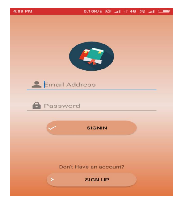
Fig -4: Client-side login activity

© 2019, IRJET | Impact Factor value: 7.211 | ISO 9001:2008 Certified Journal | Page 4129