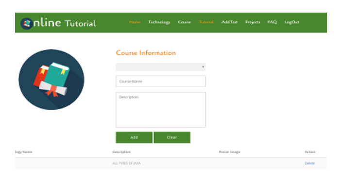
Fig -3: Admin Side Course Information