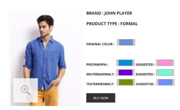
Fig -3: Diagnosed Color Palette