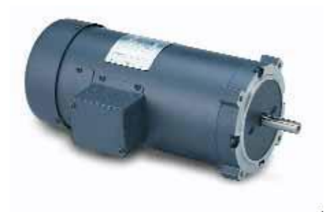
Fig. Dc Motor

When selecting DC motors, industrial buyers need to identify the key performance specifications, determine design and size requirements, and consider the environmental requirements of their application. This selection guide is designed to help with this process.