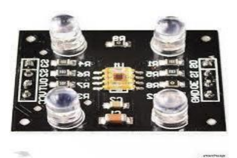
Fig. Color sensor TCS230

The TCS230 is a programmable color sensing module equipped with GY-31 light-to frequency converter that combines configurable 8x8 silicon photodiode array as single monolithic CMOS integrated circuit. The output is a square wave (50 percentage duty cycles) with frequency directly proportional to light intensity (irradiance). The full scale output frequency can be scaled by one of three preset values via two control input pins. Digital inputs and digital output allow direct interface to a microcontroller or other logic circuitry. Output enable (OE) places the output in the high impedance state for multiple units sharing of a microcontroller input line. The light-to-frequency converter reads an 8 x 8 array of photodiodes. Sixteen photodiodes have blue filters, 16 photodiodes have green filters, 16 photodiodes have red filters, and 16 photodiodes are clear with no filters. The four types (colors) of photodiodes are inter-digitized to minimize the effect of non-uniformity of incident irradiance. All 16 photodiodes of the same color are connected in parallel and which type of photodiode the device uses during operation is pin-selectable. Photodiodes are 120 mm x 120 mm in size and are on 144-mm center.