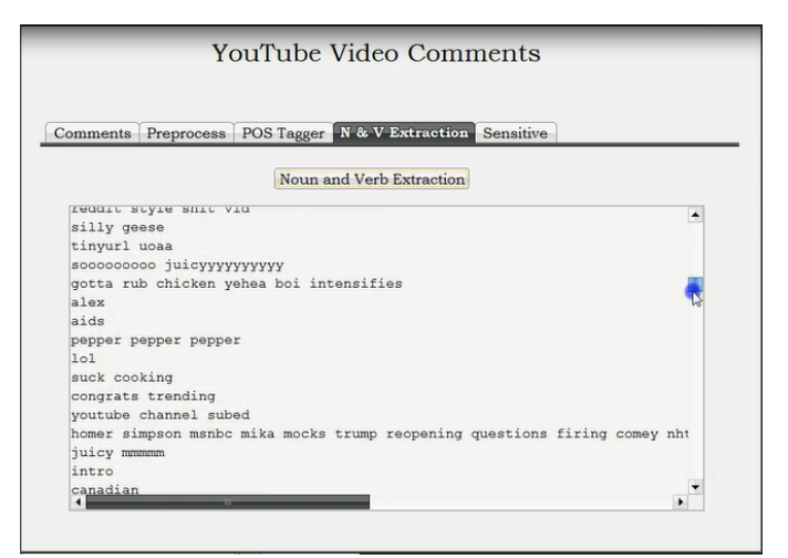
Fig. 5. Noun and Verb Extraction.

Here the nouns that is any person's or specific group's name which can be a target for threatening purposes and verbs which are the action or means of harm they intend to cause are extracted.