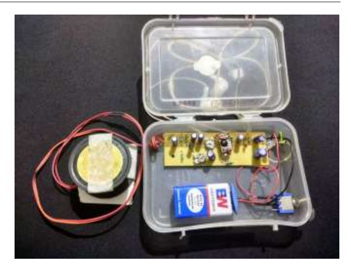
Fig -5: Echo Sounder

An Echo Sounder is a device that translates sound vibrations in the air into electronic signals or scribes them to a recording medium. It uses a piezoelectric crystal that generates small amounts of electricity under compression of a diaphragm to provide the recording signal. The operation of Echo sounder is similar to the microphone. The main difference between microphone and Echo Sounder it that the latter has high sensitivity and the operating range.