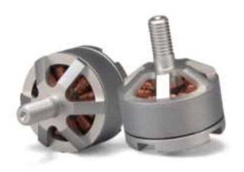
Fig -6: Brushless DC Motor

International Research Journal of Engineering and Technology (IRJET)e-ISSN: 2395-0056Volume: 06 Issue: 04 | Apr 2019www.irjet.netp-ISSN: 2395-0072