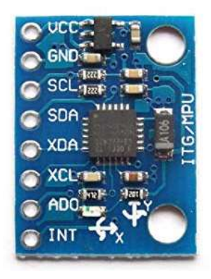
Fig -4 : GY-521 MPU 6050

also known as angular velocity sensors or rate sensors. These sensors provide stability and direction by sensing motion caused by vibrations. There are many applications of gyro sensors. In navigation systems, it can be used to sense angular velocity produced by the sensor's movements. These angles are detected through an integration operation by a CPU. An example of 6-axis gyroscope is GY 521 MPU 6050.