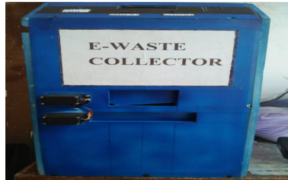
Fig. 1 - E-waste bin

After concerning above mentioned problems regarding E-waste we designed a machine that will solve the problem of collection providing people a correct place to throw E-waste that they generate.