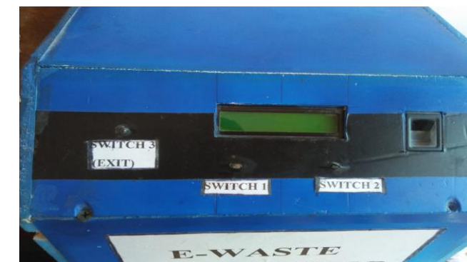
Fig. 5 - Switches on the machine

As name suggests the Small waste and Big waste refers to the size of the E-waste i.e. batteries, printed circuit boards and etc comes in the category of Small Waste and I-pad, remote and tab etc. comes in the category of Big Waste.