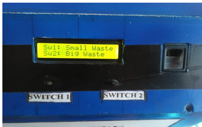
Fig. 4 - E-waste category asking message

When enrollment is done L.C.D. will display 'WELCOME' along with the name of the individual. After this a message will display which will say 1.Small waste 2.Big waste.