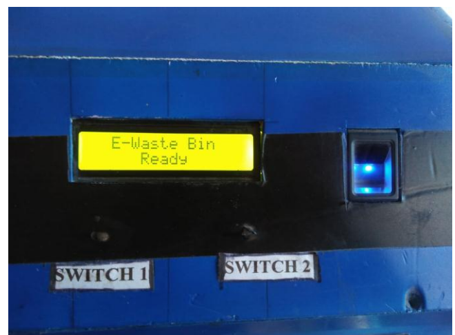
Fig. 2 - Starting of E-waste bin

A computer that will be used for preparing the database will be connected to the machine and connecting the database with a server. After making all the connections it is ready to use and the message "E-waste bin ready" will be displayed on the screen.