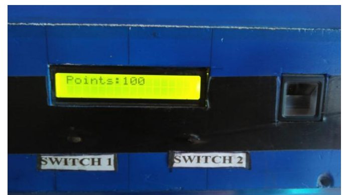
Fig. 7 - points given

Fig. 6 - (a) message for switch 2 (b) Big E-waste shutter After this one can deposit the waste and as soon as the waste is deposited, sensor detects and identifies the waste and will reward the point to the depositor according to the value or type of the waste.