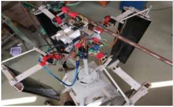
Experimental setup with servomotor mechanism

arrangement and an intelligent circuitry. The intelligent circuitry along with the potentiometer makes the servo to rotate according to our wishes. This is where the gear system inside a servomechanism comes into the picture. The gear mechanism will take high input speed of the motor (fast) and at the output, we will get an output speed which is slower than original input speed but more practical and widely applicable.