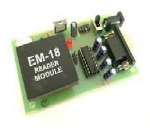
Fig.1: RFID Module

RFID stands for Radio Frequency Identification. RFID is one member in the family of Automatic Identification and Data Capture (AIDC). Technologies and is a fast and reliable means of identifying of objects. RFID reader which transmits and receives the signals. Communication between RFID readers and tags occurs wirelessly and generally does not require line of sight between the devices. This system also consist of RFID readers it is mainly used to record user information. The information recorded in the tag is transmitted to the RFID reader. The data can from RFID Reader can be read and interfaced by AVR controller. The tag contains distinct information about the car, like employee ID number or name or any other distinct data. This step accomplishes the data feed to the tag. Reading from the tag, the information from the tag needs to be read during the car parking. In this step, the data is read from the tag with the help of an RFID reader.