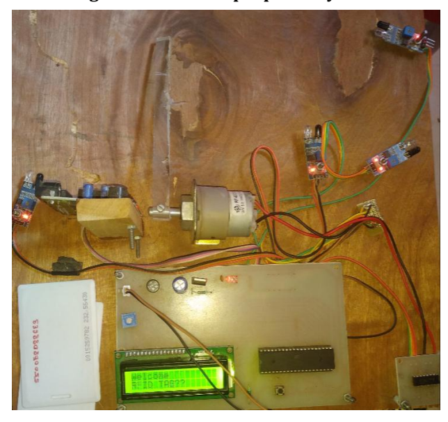
Fig. 4 Hardware Set-up