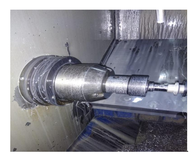
Fig 3. Fixture mount on CNC machine