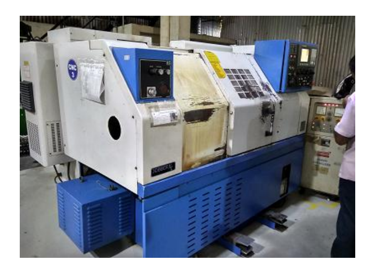
Fig 2. CNC machine

In CNC machine comparison between old fixture and new fixture after the implementing of SMED concept.