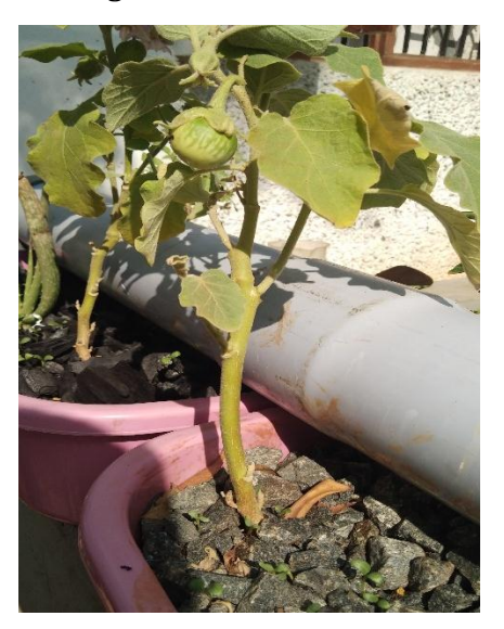
Fig 6: Brinjal plant

Higher plant densities usually mean that the yield per plant are going to be lower whereas manufacturing a better yield per space. Based on expertise, a density of 12 plants/m<sup>2</sup> will be used for both spinach and tomatoes. The six m<sup>2</sup> growing space are going to be split equally between the 2 plant species with three m<sup>2</sup> being employed to grow thirty-six spinach plants and therefore the alternative three m<sup>2</sup> growing 36 brinjal plants. Based on aquiculture and aquaponic studies, it is assumed Spinach can be harvested 12 times a year and brinjal 6 times a year.