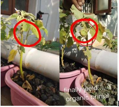
Fig 3.2: Gravel system