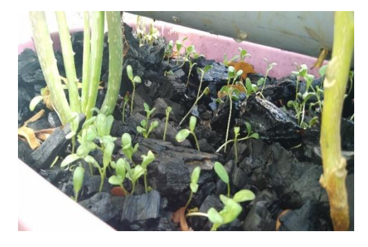
Fig 3.1: Charcoal system method

It is a cheap and readily available growing media that is filled in the grow bed. To ensure adequate aeration of plant roots, gravel beds have been operated in a reciprocating mode, wherever the beds area unit alternately flooded and drained. This methodology uses the fewest elements and no further filtration, making it simple to operate. Gravel has several negative aspects. The weight of gravel requires strong support structures. It is subject to preventative with suspended solids microbe growth and also the roots that stay once harvest.