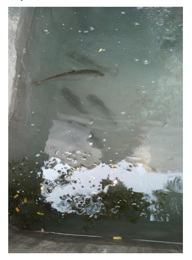
Fig 5: Tilapia fish

Stocking density in an exceedingly vivarium is measured in units of fish biomass per volume of water; kilograms per meter cubed in our case. The stocking density is a vital side for fish growth for many reasons. Water quality decreases proportionately once stocking densities square measure exaggerated, in part due to a higher production of waste, increasing the levels of potentially toxic substances, such as ammonia and nitrite. Another reason fish health is compromised once stocking densities area unit magnified is as a result of higher stocking densities lead to a lot of consumption of element and an absence of element can lead to stunted growth and reduced fish health. Under stocking the system but can lead to a lower feed conversion magnitude relation and scale back the potency of the system.