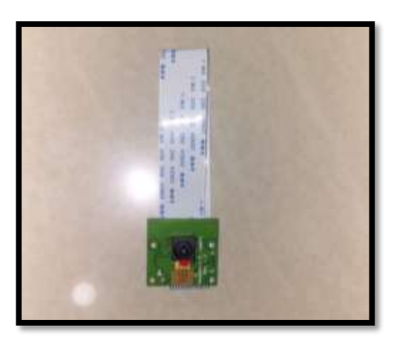
Figure 5: Raspberry Pi Camera