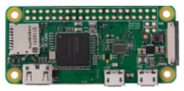
Figure 1: Raspberry Pi Zero