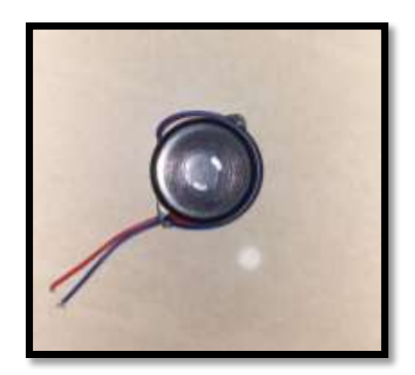
Figure 4: Buzzer

The Piezoelectric buzzers were invented by Japanese manufacturers and applied into many products during the 1970s to 1980s.