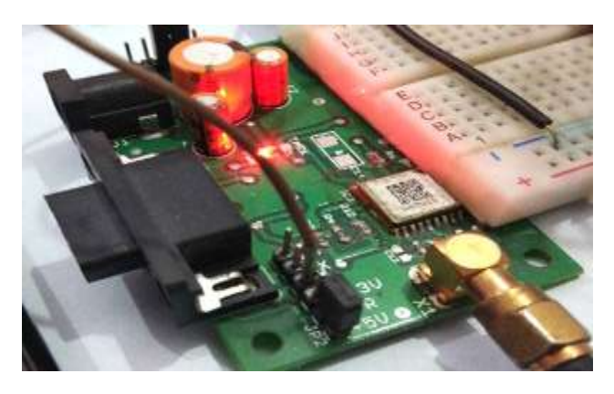
Fig-3: GPS Module

GPS is global positioning system and used to detect the latitude and longitude of any location on the earth. GPS module is used to find the location of accident . This device receives the data from the satellite for each and every time to find the location of accidents. GPS module send the data related to tracking position in real time, and it sends so many data. Format consists many sentences, in which we only need one sentence.