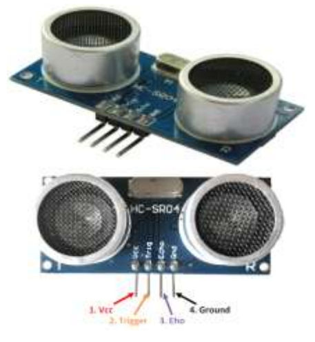
Fig -5: Ultrasonic Sensor