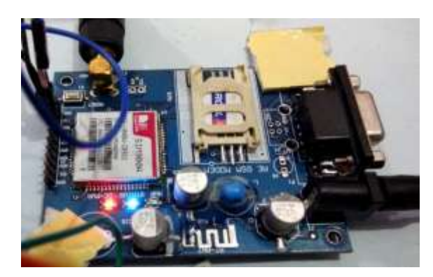
Fig -4: GSM Module

The modem needed only 3 wires (TX, RX,GND) power supply not required to interface with microcontroller or host pc. Using this modem, you will able to send and read SMS, connect to internet into the GPRS through simple at commands