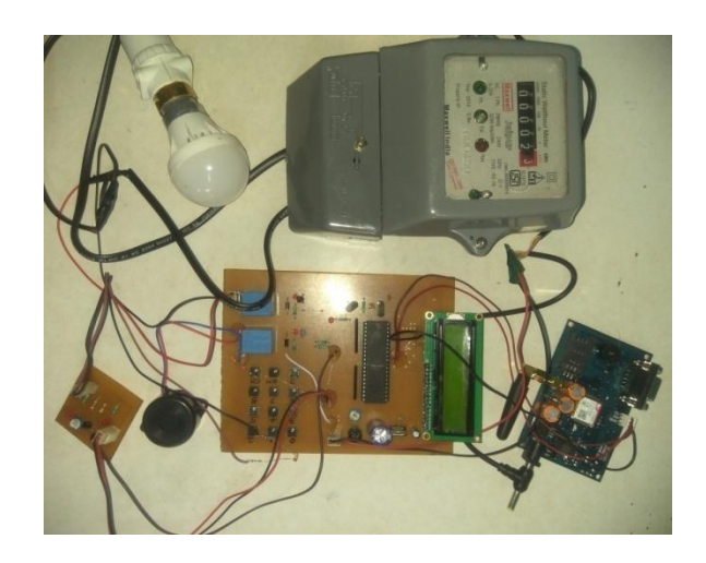
Fig-2: Set Up Of Project

we have to load the 14 digit number, printed on recharging voucher, in to system using keypad also using mobile through the GSM. After loading the 14 digit code, it is compared with code saved in memory, if it is wrong then units will not load, but buzzer will turn ON. And if 14-digit code is right, then units corresponding to that code are loaded into system. After loading the units light supply is given to customer. According to light used the loaded units will decrement. When minimum units, set by program, are remaining then microcontroller gives indication to customer to bring the new recharging voucher, to recharge the energy meter. But if he fails to recharge the energy meter then light is disconnected from the customer's house._GSM technology is used so that the consumer would receive messages about the consumption of power (in watts) and if it reaches the minimum amount, it would automatically alert the consumer to recharge. LCD display is used to display the code, error message and units etc.