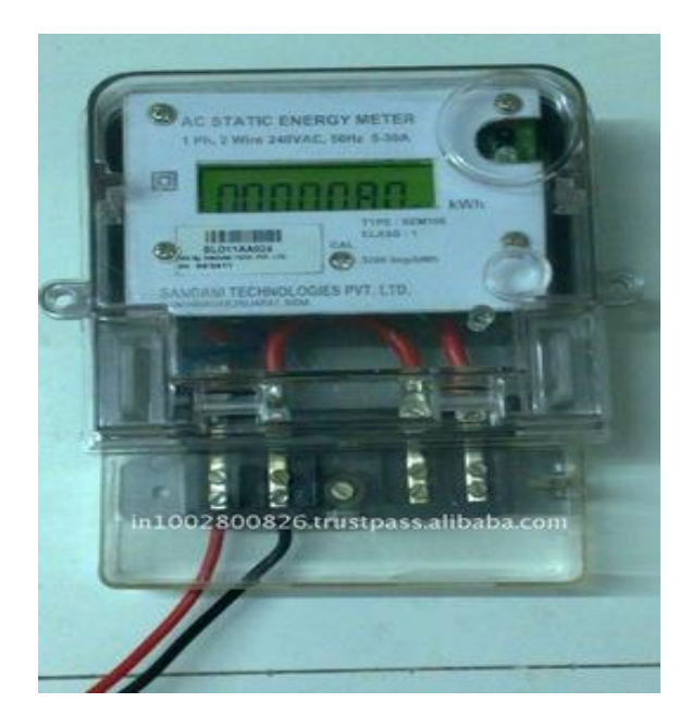
Fig-3: Energy Meter

In this project we are using conventional energy meter. When there is no supply at input terminals of energy meter then the internal disk will not rotate.