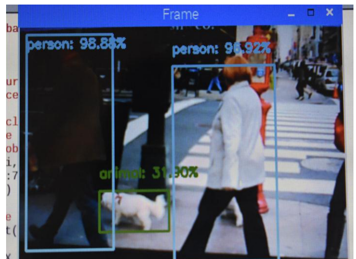
Fig -2: Person and animal detected from internet generated image

As, seen from the above figure even though the second person is present is less amount of light still the system is able to classify it correctly.