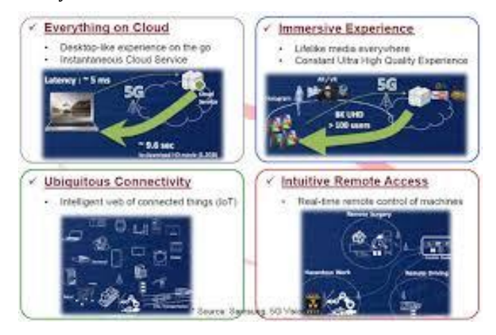
Fig -2: Entertainment and Multimedia [13]

According to survey 55 percent of mobile internet traffic has been used for video downloads globally in 2015. This will increase in future and high definition video streaming will be common in future. 5G will offer a high downloading speed on your mobiles and provide crystal clear audio and video clarity.