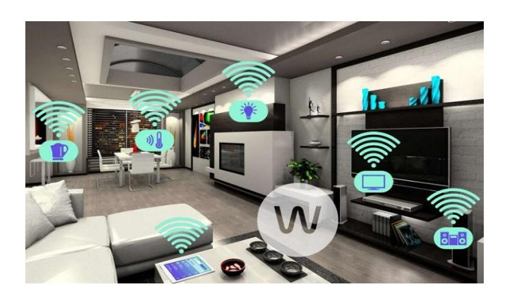
Fig- 4: Smart Home [15]

We can make our home smart by connecting all home appliances and devices to internet. One can control his/her home appliances from anywhere which helps to decrease energy wasting. Standard of living will increase [8].