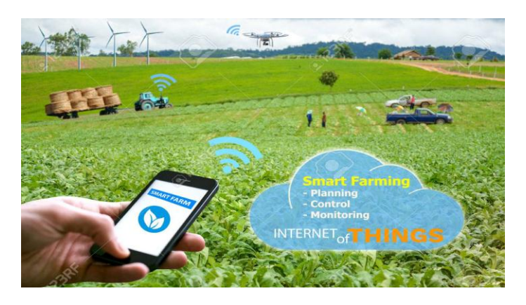
Fig-6: Smart Farming [17]

In future, 5g will used for agriculture purposes. By using smart RFID sensors and GPS, farmers can track location of livestock and manage them easily. Sensors can be used for irrigation control, access control and energy management.