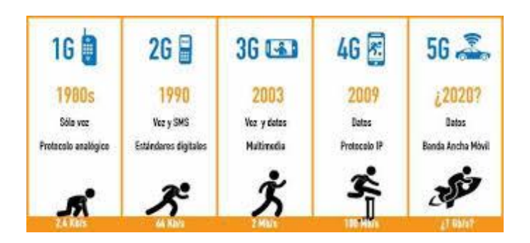
Fig-1: Speed comparison [12]

IRJET Volume: 06 Issue: 03 | Mar 2019 www.irjet.net p-ISSN: 2395-0072