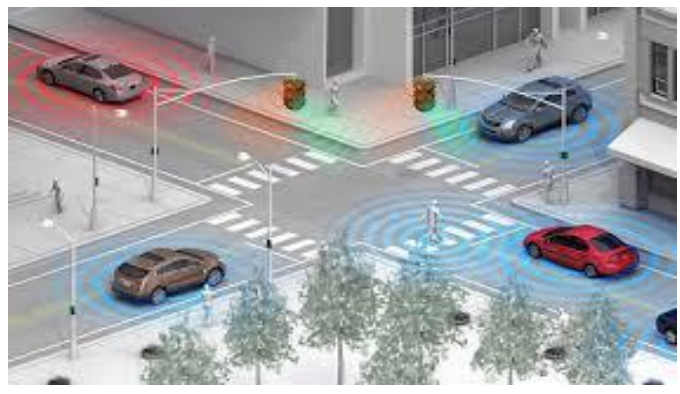
Fig-8: Autonomous cars [19]

In future, due new technologies, vehicles can communicate with smart traffic signs, surrounding vehicles and objects on the road. This will reduce traffic problems, accidents etc.