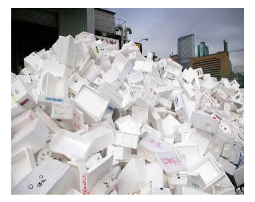
POLYSTYRENE WAST MATERIAL

3 crucibles if necessary and the concentration of respective ions were established by spectrophotometer.