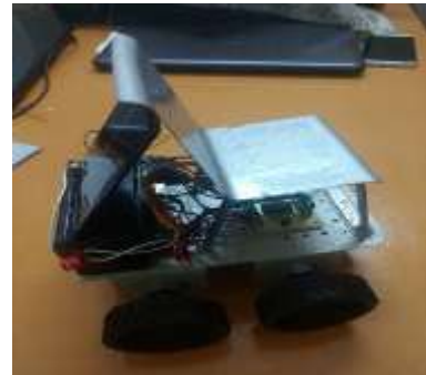
Fig.8: Android based Wheelchair

This is the downside view of the wheelchair we implemented. Two wheels are used which gives the moment to the chair as per the D.C. Motor gets instruction from the driver. The universal wheel moves as per the force and movement of the motor connected wheels.