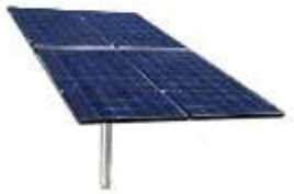
Fig.7: Solar Panel

5.6 Solar Panel: Solar panel is used for charging battery.