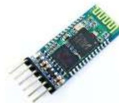
Fig.5: Bluetooth Module

5.4 Bluetooth Device: Bluetooth device is a main component from which the connection is to be made. It provides security as one device is connected at a time. Frequency is of 2.4GHz. It is much more cost effective. Used for serial communication between android device and the wheelchair