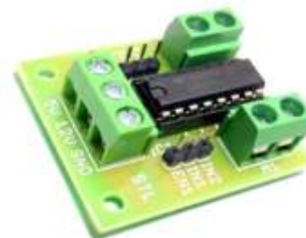
Fig.6: Motor Driver

5.5 Motor Driver: It is an interface between the DC motor and the microcontroller ATmega328p. The commands are processed further to ATmega328p towards driver and executed by DC motor to rotate the wheels in specific direction or to stop. VI) IR Sensors: Sensors is used to detect the obstacle from specific distances and alert the user about it. They are highly effective and efficient.