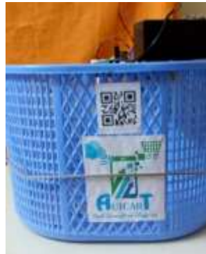
Fig: Front view of the cart with it/s unique QR CODE

Result: Customer enters a shop and picks up a product he wants to purchase, scans it with the RFID reader mounted on to the shopping cart and then puts the product in the cart. The product details which is in the form of alphanumeric code is sent to the Arduino where the Arduino processor interprets the code and sends the information to the main server and on to the customer's mobile application using Wi-Fi. Mobile App then generates the final bill and allows the customer to make payment online instead of going to the payment counter.