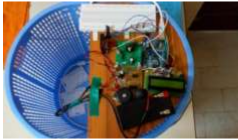
Fig: Hardware Components of the Trolley